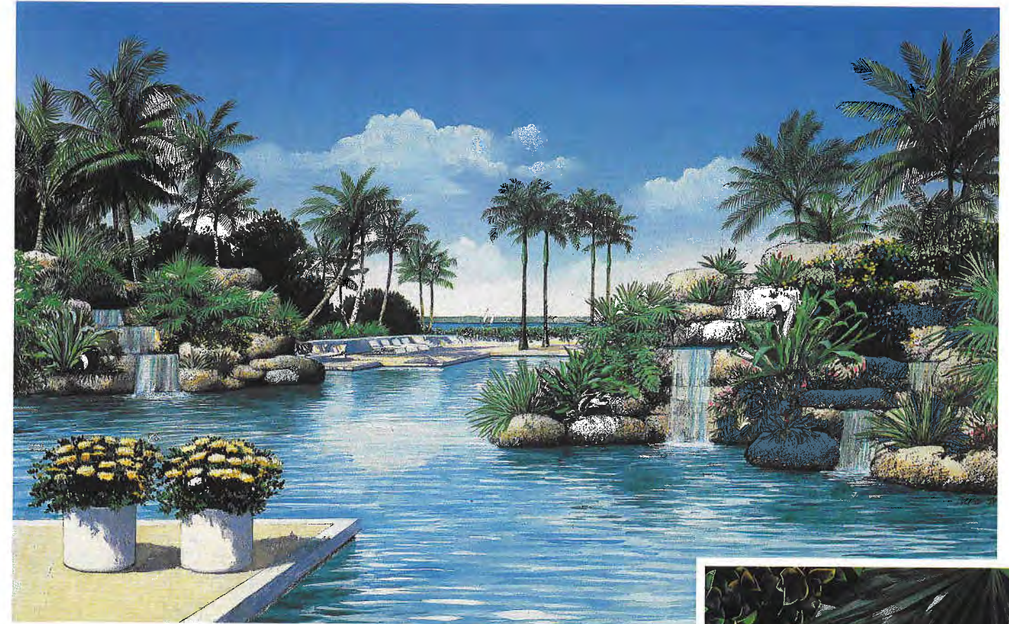
Tropical waterfalls surrounding Island Pool.

Here, one celebrates a truly unprecedented approach to condominium living. Each residence has its own fully-enclosed, two-car garage, with automatic garage door and ample room for storage. There are only three residences per floor, served by semi-private elevators. A gated, front entry courtyard leading to each home ensures your privacy. And within each residence, spacious floor plans have been designed to include every magnificent appointment. Soaring ceilings,