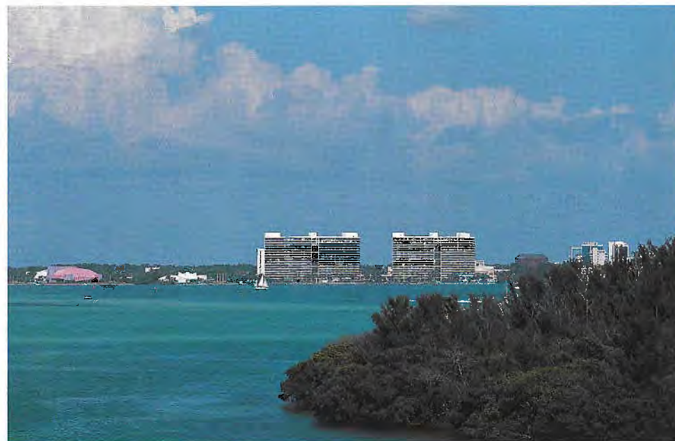
View across sparkling Sarasota Bay.