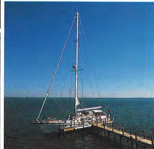
Tangerine Bay Club landing and viewing dock.