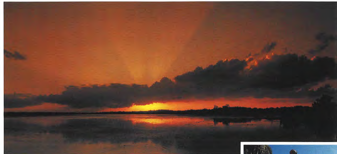
Peaceful morning views at Tangerine Bay Club.