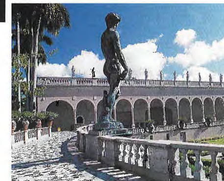
The John & Mable Ringling Museum of Art.

Surrounded by the turquoise waters of Sarasota Bay and the Gulf of Mexico, Sarasota boasts sugar white beaches, excellent boating, a wealth of shopping, fine restaurants, and a cultural calendar unparalleled for a city its size. This is the home of the Ringling Museum of Art, with its renowned collection of baroque paintings; the Asolo Center for the Performing Arts, which houses the state theater of Florida; the Van Wezel Performing Arts Hall, host to everything from Broadway musicals to ballet to the nation's best classical and popular musicians; and the Sarasota Opera, whose lavishly scaled productions have made national headlines.