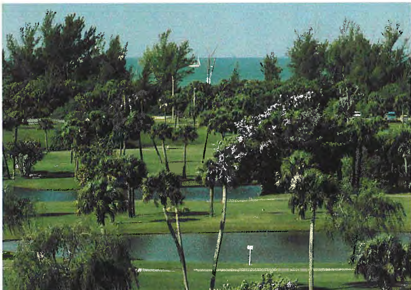
Beautiful Islandside Golf course across from Tangerine Bay Club.