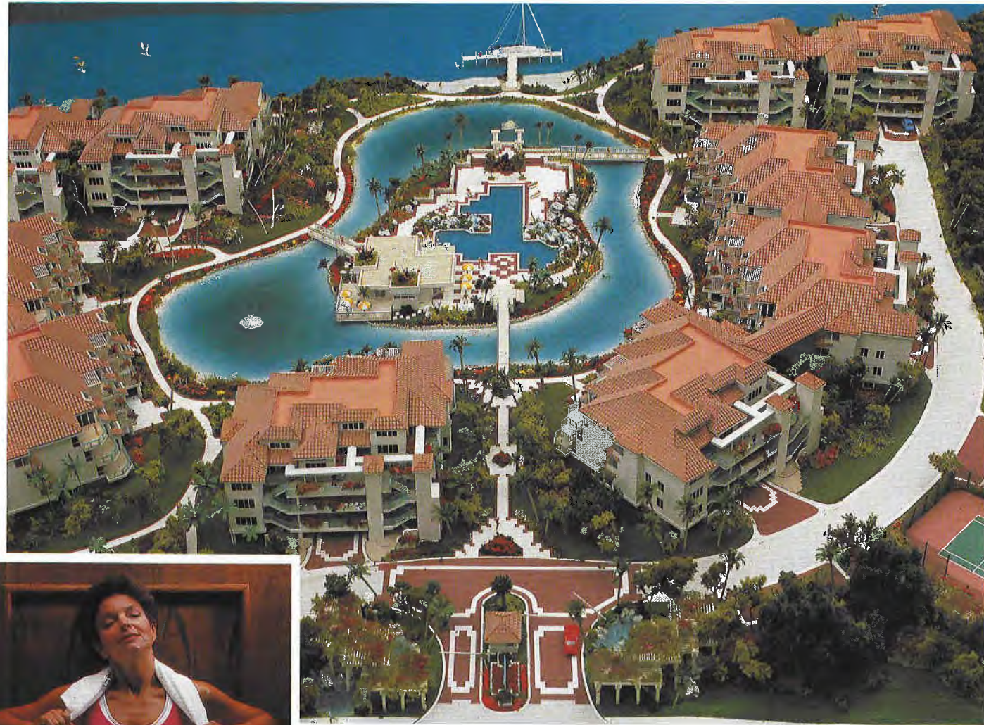
Scale model representation of Tangerine Bay Club.