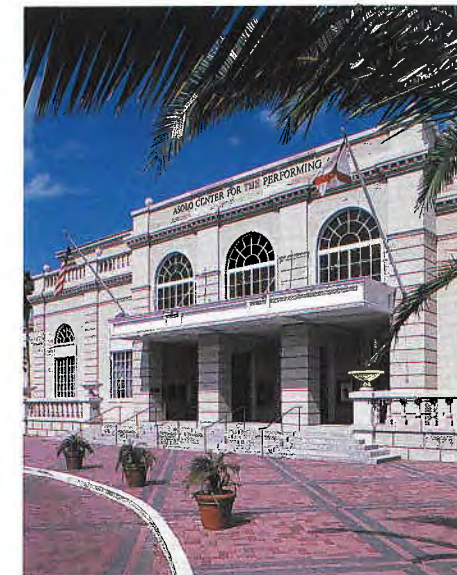
Asolo Center for the Performing Arts.